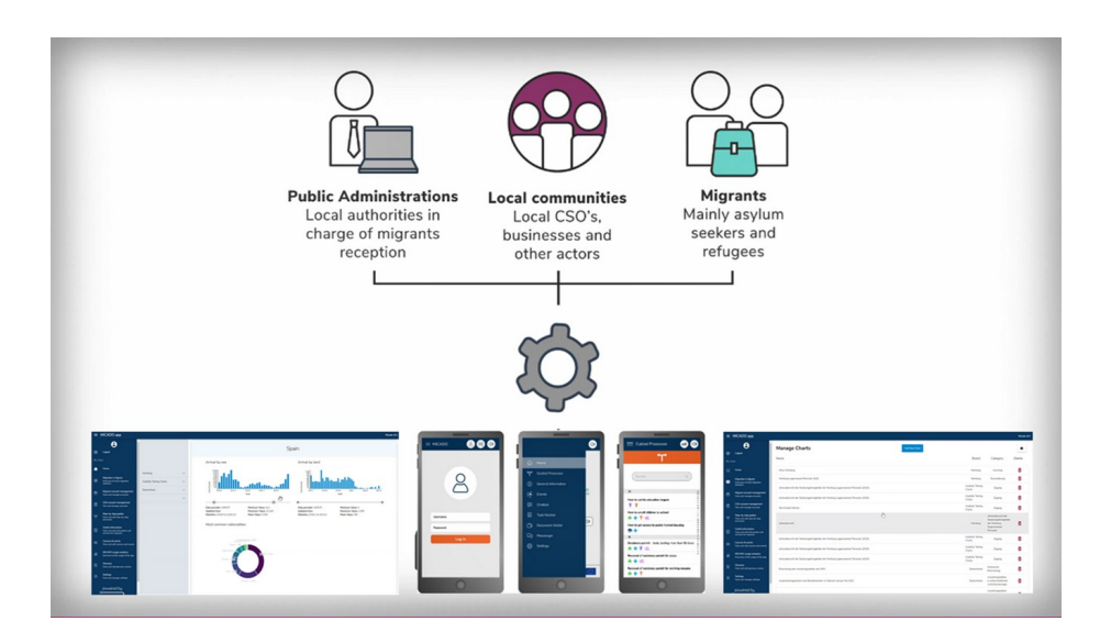
Figure 2: Distinct yet connected applications for three target groups

To adequately address the three target groups, the web design, contents, and user rights are structured differently per each application. Generally, migrants are viewed as the main users, while local CSOs and PAs produce content, monitor integration progress, and gather and exchange information about the users. For migrants, the platform presents easy information access and communication channels, interactive assistance, as well as institutional navigation through the processes of arrival and integration. Given their diverse backgrounds and different levels of literacy, the application provides for easy and intuitive handling, avoiding extensive and legalistic texts. Graphical elements are to support low-threshold accessibility and quick comprehension. To overcome language barriers, MICADO users can access content in preferred language, such as Arabic, Chinese, Ukrainian, or Dari. For illiterate users, the solution capitalises on reading tools that provide an auto read-functionality. The universally applicable MICADO prototype comprises the following key functionalities that are thoroughly linked by way of internal data exchanges and communication processes: